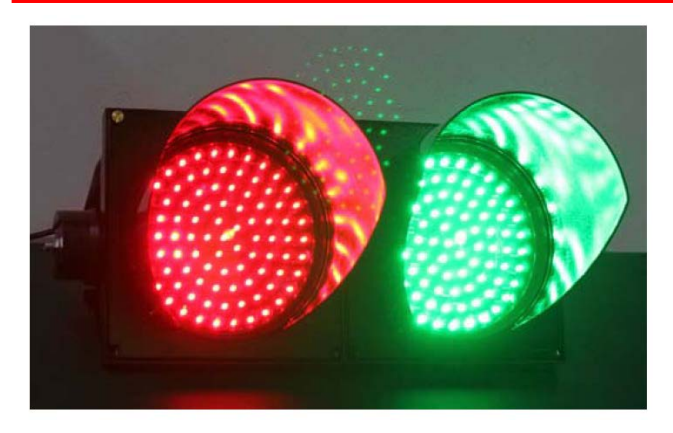
GRL200 (Traffic Lights)